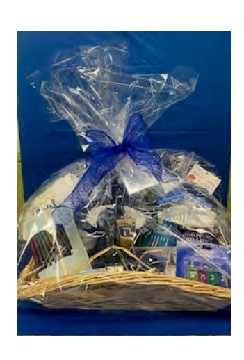
More Amazing Baskets to Come, including a Lotto Tree and 2 Tickets to TBS' 75th Anniversary Gala at Marbella May 3, 2025!!!

Come to Bazaar 2024, buy Raffles (You don't need to be present to win), have a delicious bite to eat at our TBS Café and buy presents for family, friends or yourself!